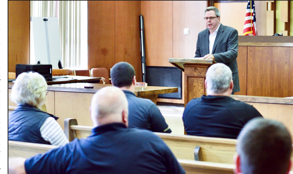
Towns County stakeholders came together in a March 17 meeting to discuss the coronavirus pandemic that is sweeping the globe.

Addressing the issue for the public, the Brasstown-based Folk School said that